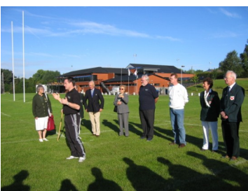
Assembly at Belfast, above